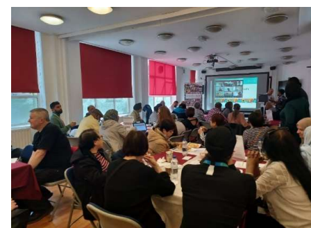
Assembly 2 – 21 st July 2022